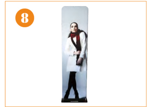
8. Completed unit with graphic shown here