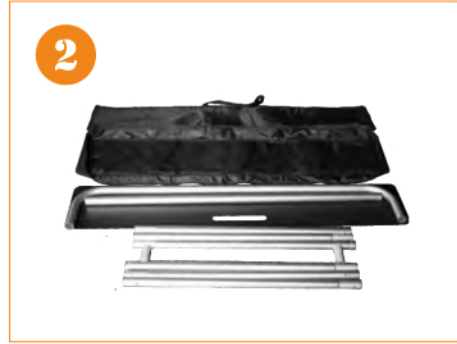
2. Remove frame components from the bag