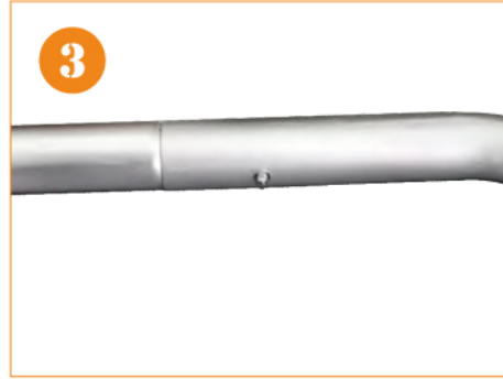
3. Lay out and assemble frame until pieces snap together securely