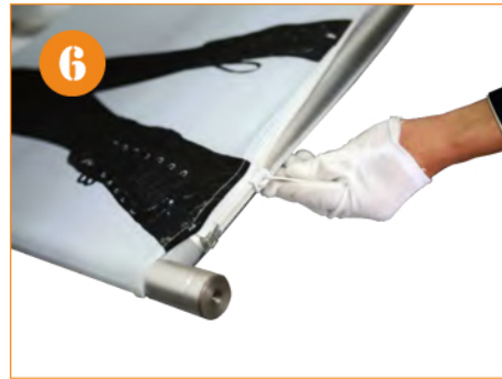
6. Fasten with zipper as shown