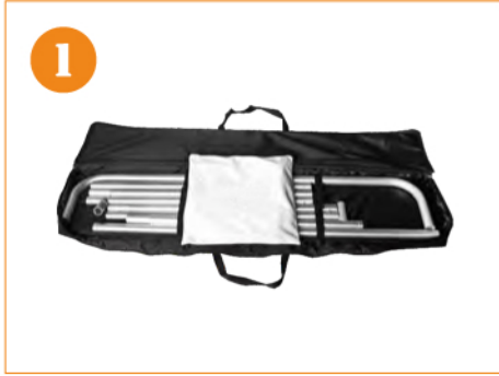
1. Open padded carry bag containing unassembled stand