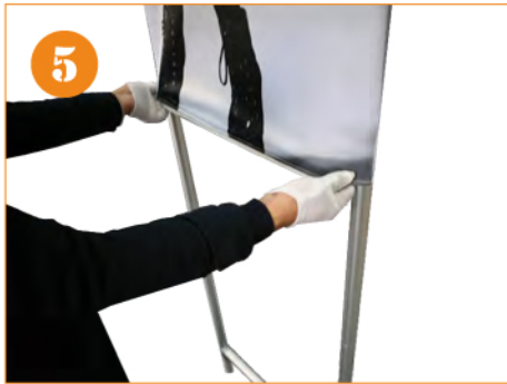
5. Carefully slide graphic over the frame to cover