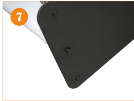
7. Attach base with provided screws