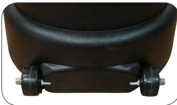
Recessed wheels and handle