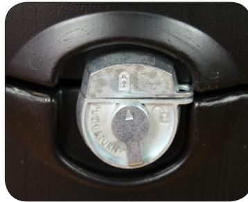
Push & turn locking mechanism